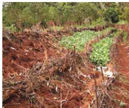
A garden with terraces

Tumbukiza method: In this method, a hole 60 cm and 60 cm wide is dug and filled with compost mixed with soil and planted with maize or Napier grass. Water from run off collects in