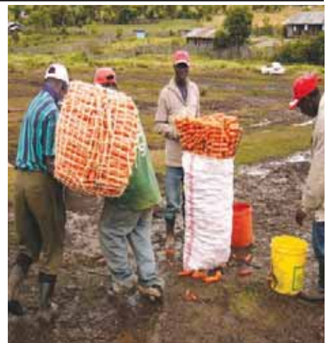
Carrots ready for market