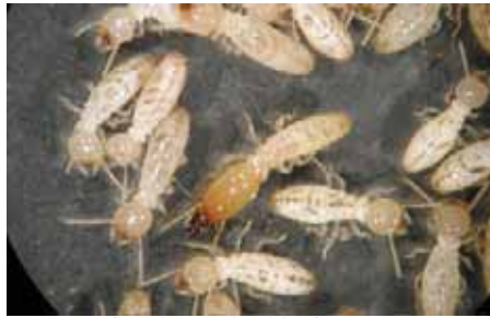
Termites (worker and soldier)

Although healthy plants may be damaged by termites, unhealthy and stressed plants are generally more susceptible to termite attack. There-