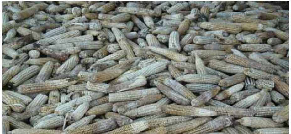
A large portion of maize harvested every year is lost to pests and rotting.

Shelling: Shelling helps to check pest damage. Since most pests prefer maize which is still on the cob for easy movement. If a farmer has to apply pesticides, this should be done after