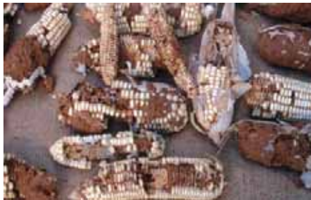
Damage to maize cobs

fore, cultural practices should aim at maintaining or enhancing plant health.