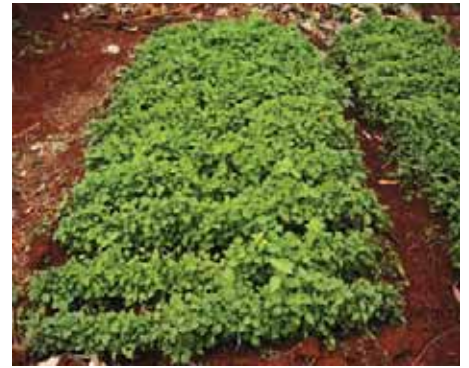
Farmers can propagate their own organic seeds

This starts with making application to KEPHIS and if successful, being granted a Q-license to import, with certain conditions. A Q-license is a quarantine license and comes with the following requirements: Documentation of the origin of the seed must be supplied to KEPHIS and on entering the country, the seed is immediately taken to and tested at the KEPHIS laboratories. If it is seen to be carrying pathogens foreign to our local pathogens, it will be destroyed. From there, germination tests are done and if all goes well, you will be given the seed on certain planting conditions. The entire planting area will be quarantined, which includes 6 foot plastic sheet fencing and foot and car/tractor baths at all entrance and exits. Transfer or sale of the seed is also prohibited. As you can see, as organic producers we are caught between a rock and a hard place. To import following the regulations is expensive, time consuming and risky. To grow