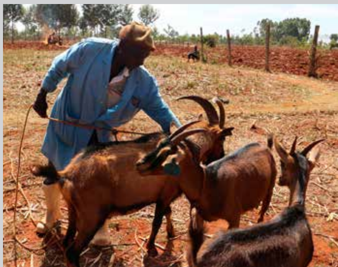
A beneficiary to TOF magazine tending his goats. This shows the impact of knowledge acquired from the magazine

The demand for the magazine has been growing each month.