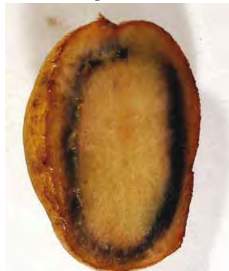
The black ring shows the presence of Ralstonia solanacearum , the bacteria that causes the wilting of potatoes