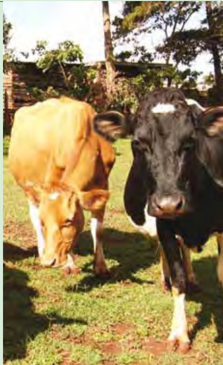
There is growing interest in dairy cows. We are receiving many questions in this area.

Therefore, we recommend that farmers keep livestock out of avocado orchards, and to avoid planting avocado trees near animal enclosures.