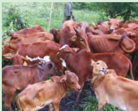
Good management practices help maintain your animals health

during close contact with the animal. This disease is life threatening and more frequent in Kenya than in most other countries of the world. Therefore always boil raw milk before you consume it! Preparing traditional fermented milk does not eliminate the tuberculosis bacteria.