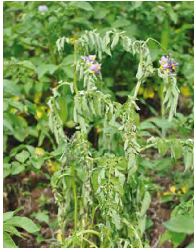
This sign of bacterial wilt is often mistaken for lack of water