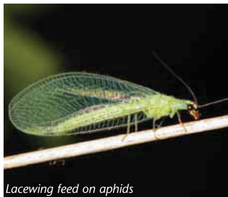
Lacewing feed on aphids

The scientists offer two possible explanations for this phenomenon. One possibility is: The insecticides indiscriminately kill off beneficial animals that feed on the aphids, such as ladybugs or the larvae of lacewings and hoverflies. Because their enemies are missing, the aphids find it easier to return and proliferate than in insecticide-free fields. Another possibility is an indirect effect: The insecticide just kills the aphids,