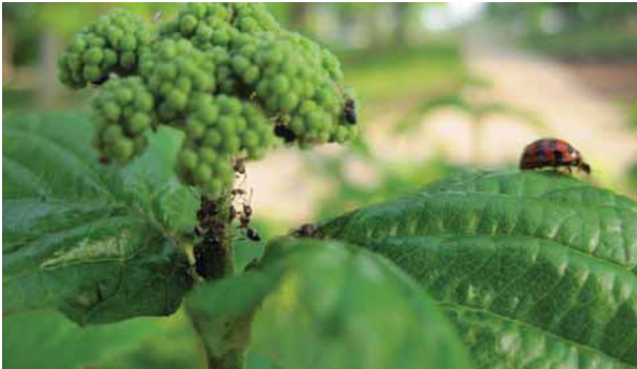
Ants feeding on sap produced by aphids and a lady bird (right) eating aphids.