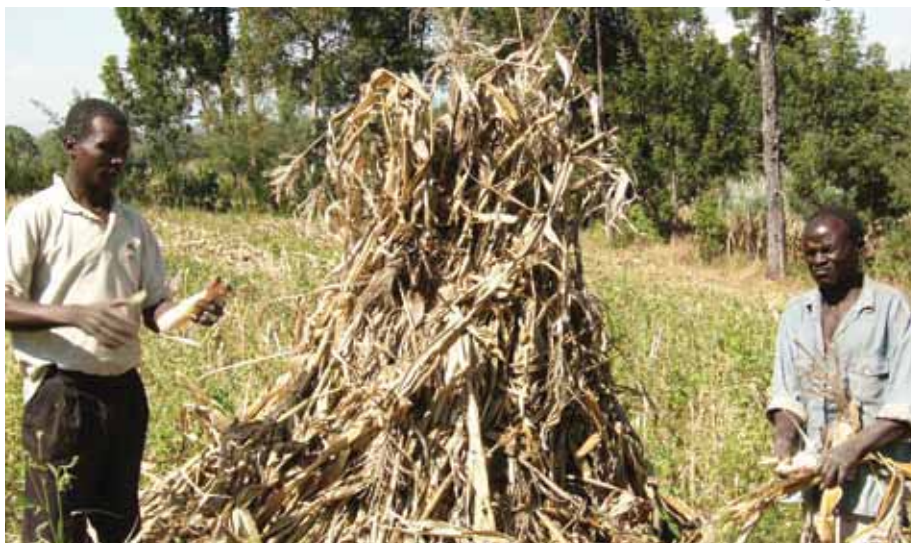
Early harvesting and proper drying ensures maize does not develop moulds (as shown in the picture below).

Dry your maize immediately after harvest while the maize is still on the