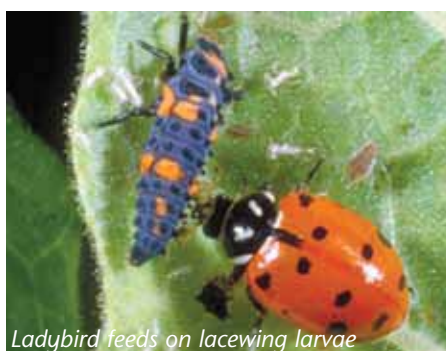
Ladybird feeds on lacewing larvae

In conventional fields that have not been sprayed with insecticides, the pest control through natural enemies seems to work better – thanks to the higher biodiversity in these fields. The biodiversity is far greater in fields under organic management. The researchers found five times as many plant species and 20 times more types of pollinating insects in the 15 organic crop fields included in the study than they did in conventional fields. Furthermore, they detected three times as many natural enemies of aphids and five times fewer aphids in the organic fields than in the conventional fields.