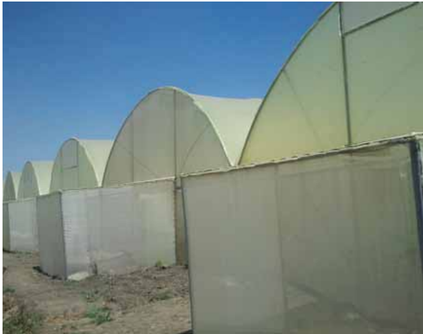
The entrance cubicle provides a changing area and a footbath for greenhouse workers.

Plant growth is determined by the controlled conditions inside a greenhouse. Greenhouse production requires constant temperatures and humidity control - around the clock. In large-scale professional greenhouse production, this is done with the help of technical equipment which small farmers cannot afford. But farmers need to check temperature and humidity in small greenhouses. A greenhouse can overheat very easily in the bright sun, and condensation must be checked. Therefore, ventilation is