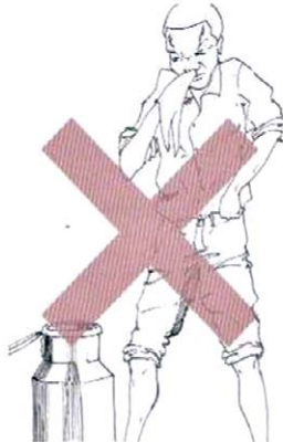
...sneeze or cough