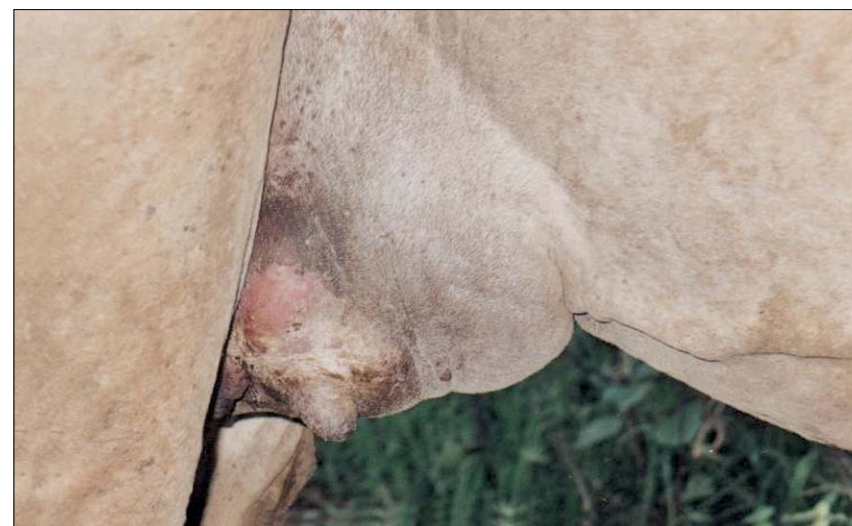
Mastitis symptoms in high yielding camel (note large milk vein). The quarter has become hard and hot to the touch, and a red swelling has appeared. The camel may kick excessively as the quarter has become painful to the touch.

Mastitis is the name for the inflammation of one or more milk canals and the udder of milk producing mammals.