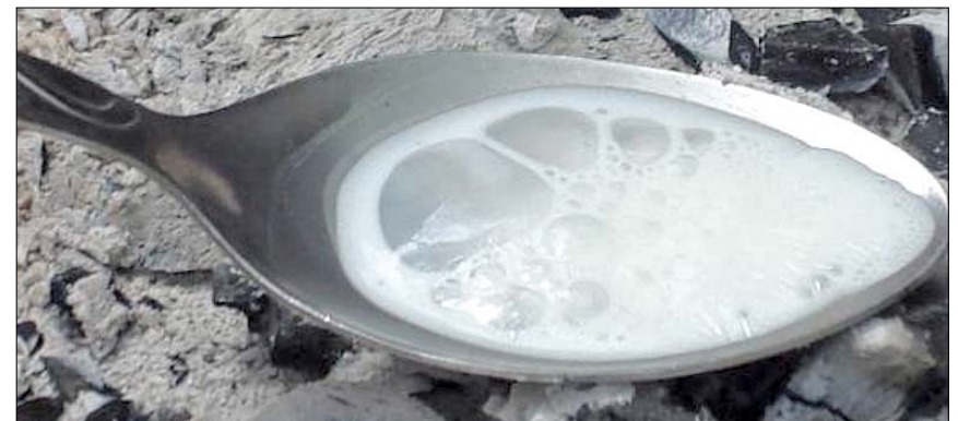
Clot on boiling test; if it clots the milks has gone bad