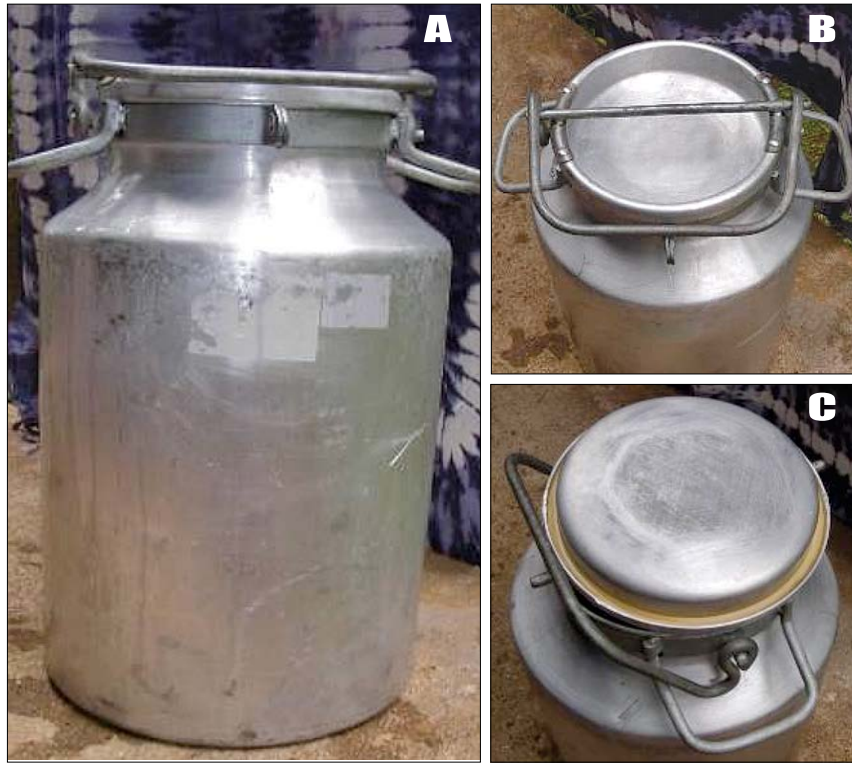
A: Perdini 25 L milk can; B: NOTE: Securely closing lid. A padlock can be added; C: NOTE: inside rubber seal in lid to make sure it does not spill