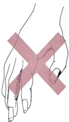
...have long nails