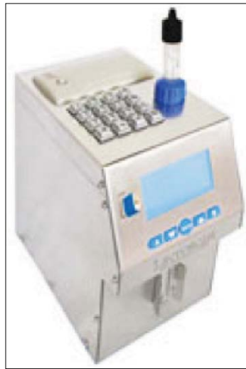
Many models of the Lactoscan available (please check the internet)