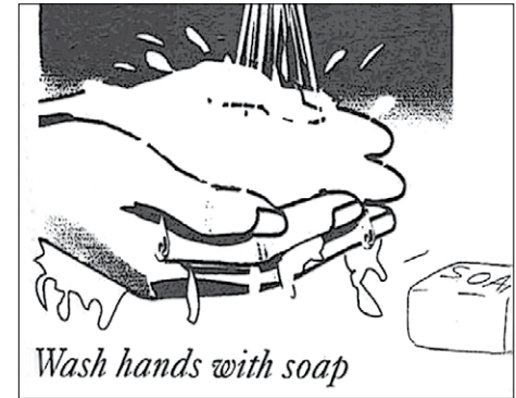
Washing hands before milking and in between milking every animal

Care should be taken to NOT MIX mastitic milk with clean milk. Always wash hands between milking every animal.