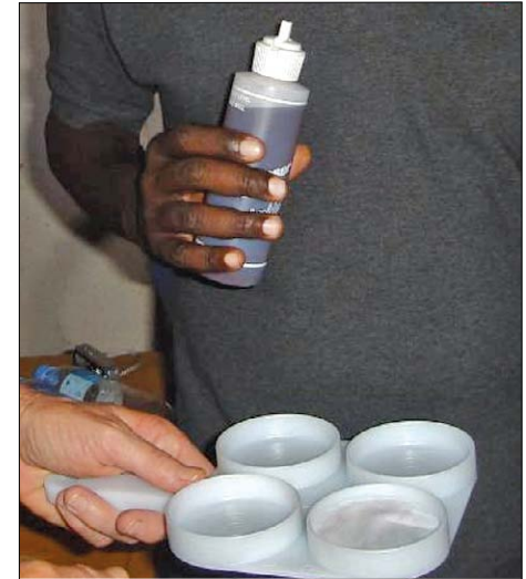
California Mastitis Test (CMT)