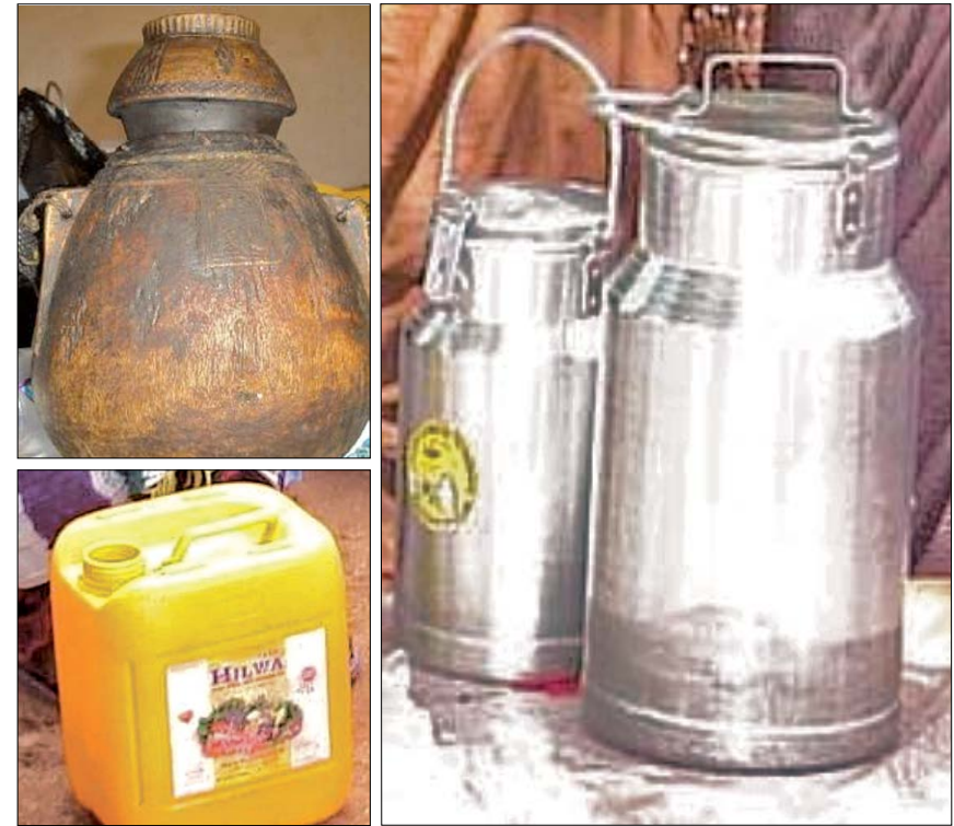
Aluminum and stainless steel milk cans are much easier to clean than both the traditional containers and the jerricans. They can be disinfected after washing by dipping in boiling water, and become virtually germ free – which means longer shelf life for the milk as there is no contamination from cans

In high potential areas heavier duty milk cans are used as they need to be able to withstand punishment in a different type of transport – pure milk transporting vehicles.