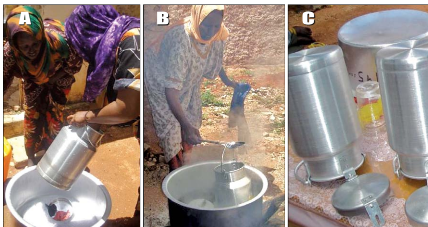
A: Rinse out the soap/detergent; B: Sterilising in boiling water; and C: Dry upside down in the sun on a clean table or rack

Do NOT dry containers inside with any cloth. Cloths may be very dirty and can add serious contamination to an otherwise clean container.