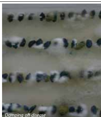
Damping off disease