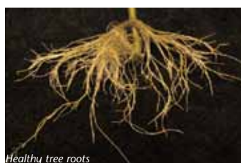
Healthy tree roots

Microscopic (2mm long) round worms that infect plant roots eg. Meloidogyne sp. (root knot) Pratylenchus sp. (root lesion). Exiphinema sp. (corky roots) and Dixylenchus sp. that cause stem lesions.