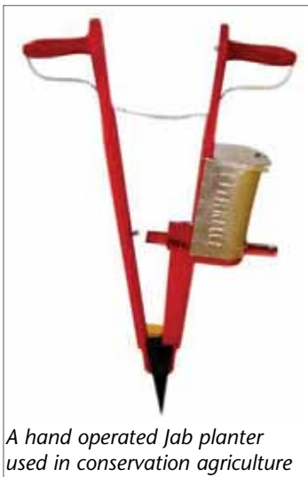
A hand operated Jab planter used in conservation agriculture

Although only about 2 per cent of small-scale farmers practise Conservation Agriculture worldwide, it is considered a useful method that increases farm productivity, and reuses