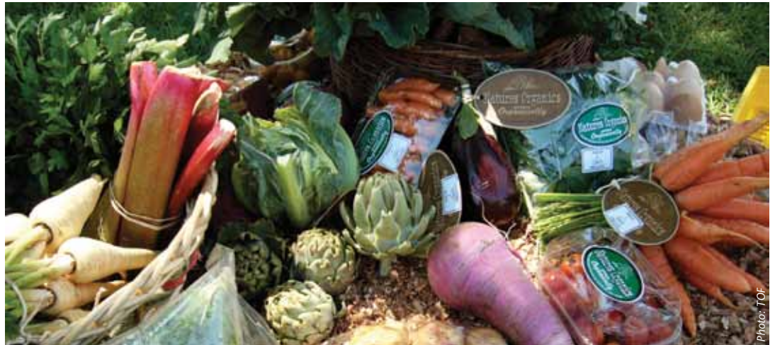
Organic production has not kept pace with the big demand for organic products.

Small-scale farmers groups that would like to sell their produce should know that it is not possible for farmers to market their organic produce