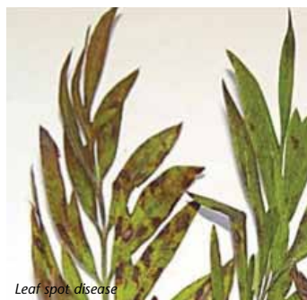
Leaf spot disease