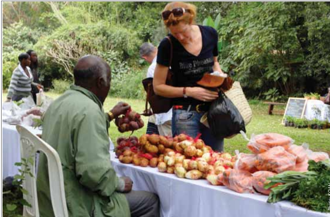
The market for organic products is growing so fast that farmers are unable to meet the demand.