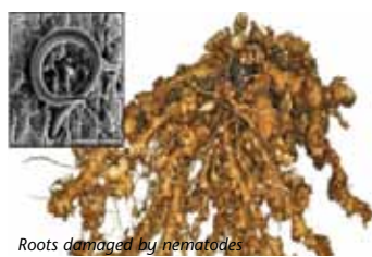
Roots damaged by nematodes