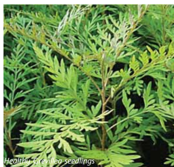
Healthy Grevillea seedlings

Under conducive environments, leaves are prone to diseases such as leaf spots, leaf blights, leaf fall, leaf yellowing, galls, rots and mildews. Branches and shoots can be affected by cankers, diebacks, and tip deaths, among others. Diseases that affect the development of seeds and fruits may sometimes cause fruit rots and falls.