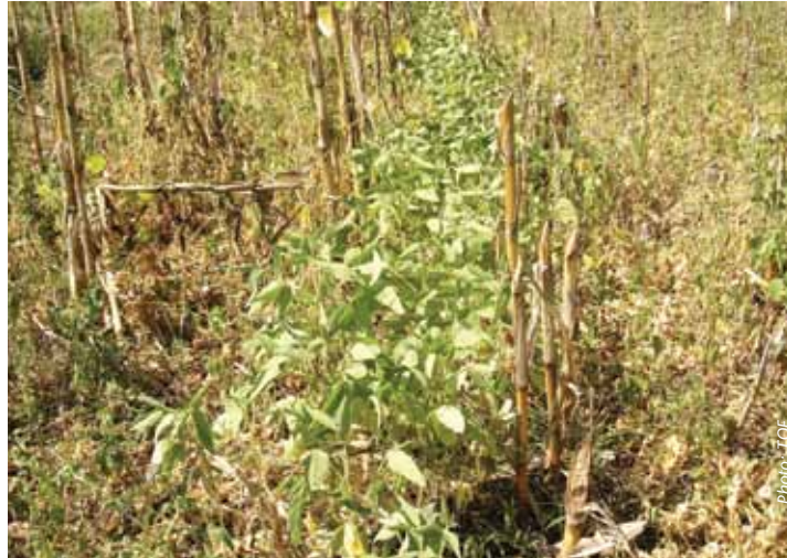
Conservation agriculture promotes permanent soil cover to protect and conserve soil structure. Animal drawn planter (below, right).

crop residue and related organic material on the farm. There are certain compelling factors that have made some farmers adopt conservation agriculture. These include: