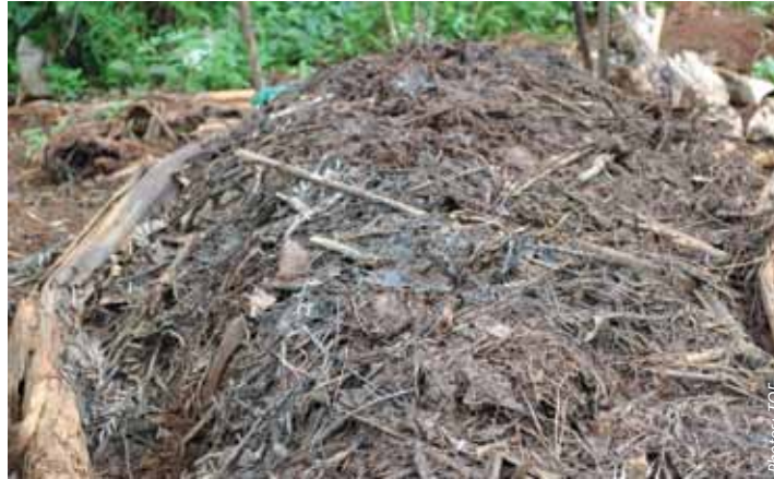
If made the right way, compost can meet all your fertilizer needs

2. Select a place that is sheltered from the wind, rain and sunlight. It is always advisable to make several small heaps if you have a lot of compost material instead of one large heap, which takes a lot of time for compost to be ready. A one metre high pit is ideal. But it is not always necessary to dig a pit because