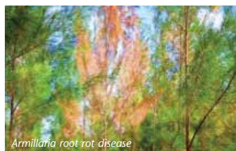
Armillaria root rot disease