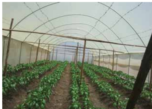
Capsicums in a greenhouse

Greenhouses environment has many negative and dangerous consequences for people working in them especially in conventional farming where chemical application is normal. Most of the chemicals have a lot of side effects on human health. Workers, especially in flower farms, develop serious complications as a result of the chemicals used to control pests and diseases. All companies or farmers are required to provide protective clothing to greenhouse workers. Poor use of such equipment has, however, led