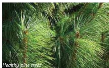
Healthy pine trees

Tree diseases that are found in the roots include root rots, change in root color and even rotting of the stem some of which may lead to plant death caused by the above named fungi.