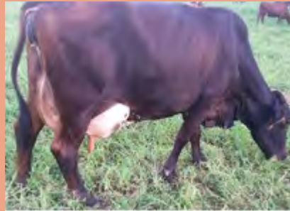
"Baldhos" has peaked to 34.1 ltrs/day and produced 6147 ltrs in 302 days