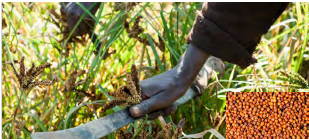
Finger millet is an orphan crop, meaning farmers ignore it but it is an important food security crop because it can withstand drought and it is more nutritious than maize

Farmers in Western Kenya have discovered the benefits of this forgotten food crop. They are now investing and reaping its nutritional and income benefits.