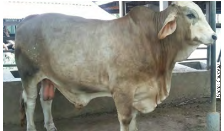
This bull from Makitoshia farm is called "ARBO." He is descended from C.A Sansao and his bloodline is 50% Gir, 25% Fleckvieh and 13% Sahiwal. He attained 1000kg live weight in 24 months

By using the hybrid vigour (heterosis) of the Gir Breed, Makitoshia