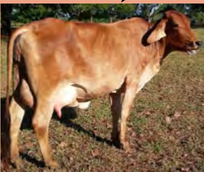
"Duko" has peaked to 28.2 ltrs per day