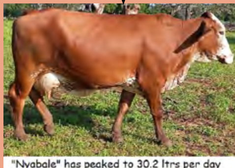
"Nyabale" has peaked to 30.2 ltrs per day and produced 8157 ltrs in 427 days