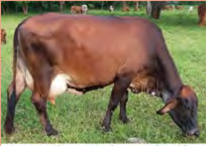
"Goroms" has peaked to 37.3 ltrs/day and produced 9330 ltrs in 429 days