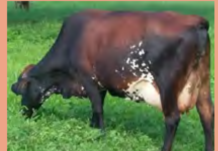
"Figo" has peaked to 28.9 ltrs per day

C.A Sansao from Brazil- He is the founding sire of Makitsha farm Magic breed crosses and the world's best ever and most expensive dairy Gir sire.