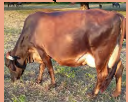
"Nyati" has peaked to 30.1 ltrs/day

the dairy cows achieving up to 14 calvings in their productive period.