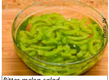
Bitter melon salad

In immature vegetable form, bitter melon is also a good source of nutrients including Vitamin A which promotes growth, boosts the immune system, reproduction, and improved vision, vitamin C which helps the body to make collagen, an important protein used to make skin, cartilage, tendons, ligaments, and blood vessels. Vitamin C is also needed for healing wounds, and for repairing and maintaining bones and teeth, It also contains iron, which is important in red blood cells (haemoglobin) and muscle cells (myoglobin). Haemoglobin is essential for trans-