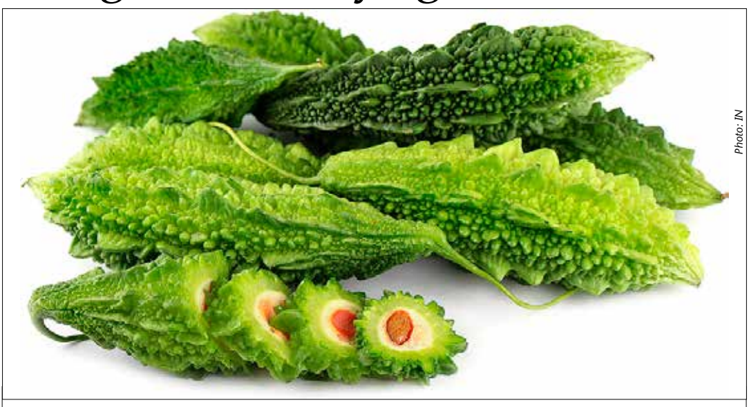
Eating bitter melon improves human health

In immature vegetable form, bitter melon is also a good source of nutrients including Vitamin A which promotes growth, boosts the immune system, reproduction, and improved vision, vitamin C which helps the body to make collagen, an important protein used to make skin, cartilage, tendons, ligaments, and blood vessels. Vitamin C is also needed for healing wounds, and for repairing and maintaining bones and teeth, It also contains iron, which is important in red blood cells (haemoglobin) and muscle cells (myoglobin). Haemoglobin is essential for trans-