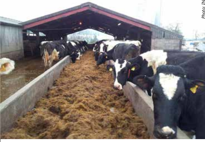
Toxin binders protect feed from aflatoxins

To understand why farmers prepare fermented feed for their animals, we need first to understand how animals such as cows, sheep and goats (ruminants) digest their feed. When a cow feeds on any feed, be it grass or concentrates, the feed is converted into proteins carbohydrates or vitamins. Any feed eaten by a dairy for example passes into the reticulum (first stomach), then to the rumen (second stomach), omasum (third stomach) and finally abomasum (fourth stomach).