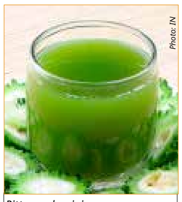
Bitter melon juice

Pregnant women, those who are trying to become pregnant,