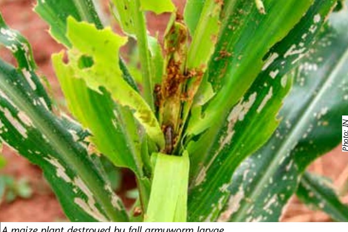
A maize plant destroyed by fall armyworm larvae

Mature larvae vary from light tan or green to nearly black. They have three yellow-white hairlines down their backs. On each side and next to the yellow lines is a wider dark stripe. The moths have a wingspan of 32 to 40 mm. They have dark grey, mottled (coloured spots) on the forewings with light and dark splotches (marks), and a noticeable white spot near the extreme end of the worm.