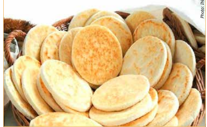
Biscuits made from cassava flour

Cassava tuber is rich in the B-complex group of vitamins such as folates, thiamin, pyridoxine (vitamin B-6), riboflavin, and pantothenic acid. It is a good source of some essential minerals such as zinc needed for the body's defensive system to work properly. It plays a role in cell division, cell growth, wound healing, the breakdown of carbohydrates and for the senses of smell and taste. The magnesium in cassava also helps to maintain normal nerve and muscle function, supports a healthy immune system, keeps the heart beat steady, and helps bones remain strong. The copper in the tuber works with iron to help the body form red blood cells, helps keep the blood vessels, nerves, immune system, and bones healthy. Iron is found in haemoglobin which is essen-