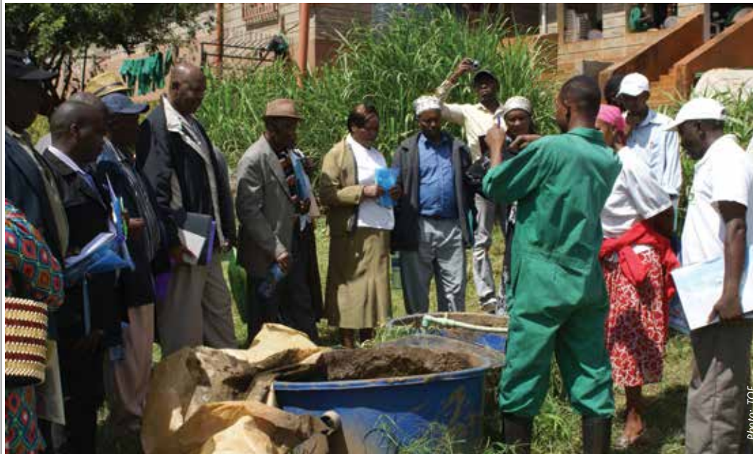
Farmers from Nairobi and the Central region learn how to make compost from biogas residue during an education tour of the Real Impact's Kichozi farm in Thika last month. The farm uses biological and environmentally friendly methods to control pests and other plant diseases. During the visit organized by Pelum Nairobi and Central Zone. The group of 70 farmers petitioned the government not to allow GMOs into the country.