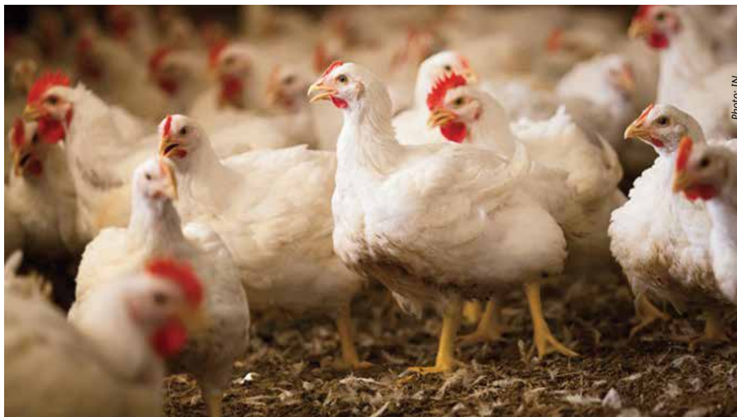
Hygiene in the poultry shed is the major cause of Foot Pad Dermatitis (FPD) disease.

Overstocking of broilers in a house is not good - always ensure the right number of poultry is kept - floor space of 4-5 square feet per bird. Drinkers should be placed at the right height and a reasonable distance and distribution to avoid overcrowding of birds at the time of drinking- do not put the drinkers at one corner in a poultry house. Use the right type of drinkers to avoid water splashing on the litter and wetting the floor.