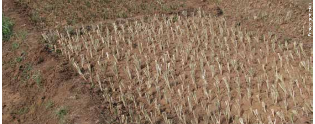
Planting cuttings can be propagated in nurseries and then transferred to the field when the rains come.

Stolons (long stems): Grasses like Brachiaria brizantha have stolons (long stems). While looking for planting material for