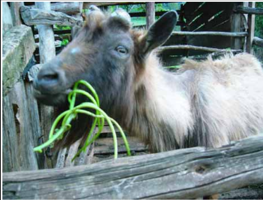
Dairy goats are becoming popular with many farmers, page 4,5