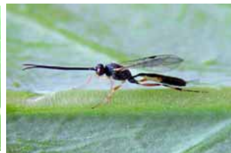
. . .and its enemy, the wasp

Control of the moth has remained a tricky issue. This completely cosmopolitan pest, which tolerates the tropical, subtropical and temperate climates, extending as far north as the Arctic Circle in Europe, is notorious for developing pesticide resistance. In Kenya and the East Africa region, ICIPE, the International Centre for Insect Physiology and Ecology, is making great strides in the control of the moth as part of the Centre's research into the pests of staple food crops and horticultural crops. ICIPE is working with partners to develop Integrated Pest Management strategies