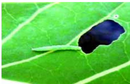
Larva of Diamondback moth. . .

Various factors have contributed to the low yield and returns, the most important being insect pest damage, which can lead to up to 100% loss if not controlled. One of the cabbage's major devastating pests is the Diamondback Moth ( Plutella xylostella DBM), a small greyish-brown insect which gets its name from