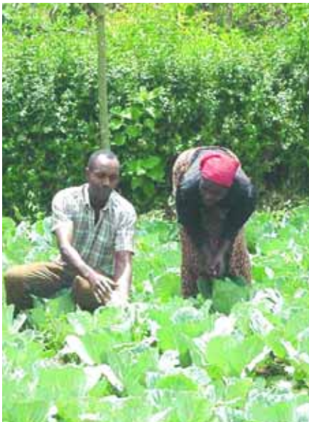
Releasing wasps in the field near Karatina

enemies), which are a major feature of Integrated Pest Management. The project commenced with a survey in the major cabbage growing areas in Kenya, Uganda and Tanzania, which showed that existing enemies were not providing a big enough impact in control of the Diamondback Moth. ICIPE therefore imported an exotic parasitoid, a parasitic wasp ( Diadegma semiclausum ), already being used in a number of countries in South East Asia (Taiwan, Indonesia, Mainland China). The wasp stings the Diamondback Moth larvae, lays its eggs, which hatch into larvae, which feed on the internal organs of the moth causing death. The wasp's larva pupates in a cocoon inside the loosely