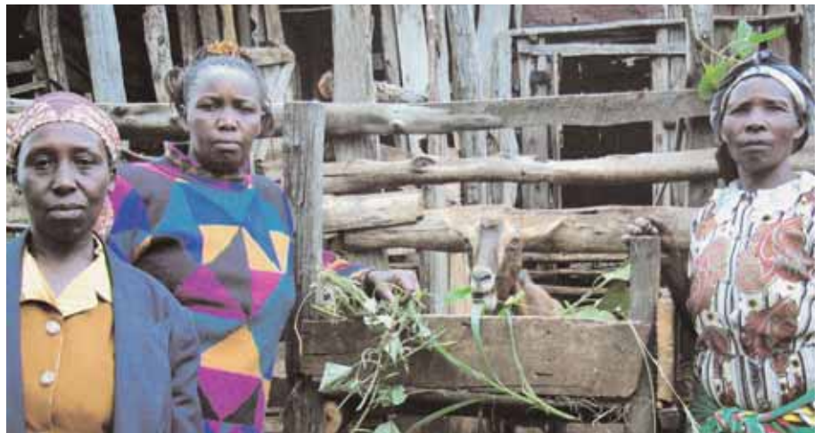
Kunyotoka Group members at their goat demonstration shed.