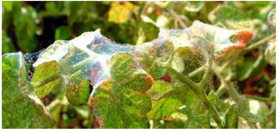
Spider mite web on a tomatoe plant. The red points on top are female adult mites waiting to be blown by the wind to the next plant for getting more food.

The two most important spider mite species (types) in Kenya are the tomato red spider mite and the two-spotted spider mite. The tomato red spider mite is not native to Africa. It