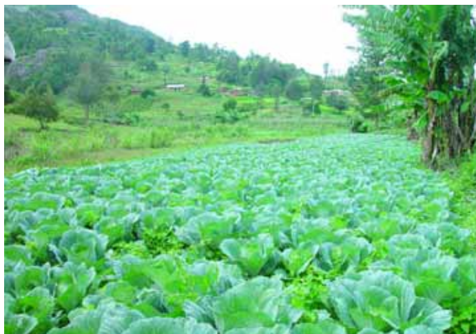
Cabbage crop 2 years after releasing wasps