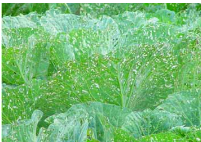
Nothing left to harvest: Infested cabbage